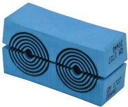
GM module with Multidiameter™

For detailed information, please visit roxtec.com .